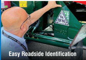
Easy Roadside Identification