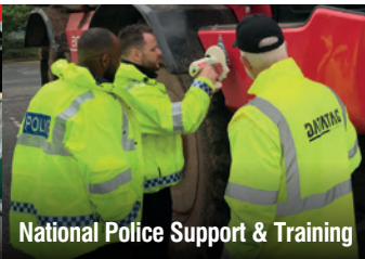
National Police Support & Training