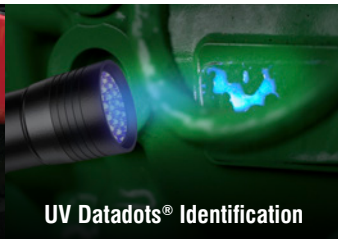
UV Datadots® Identification

To find your nearest dealer visit: www.cesarscheme.org/dealer.php